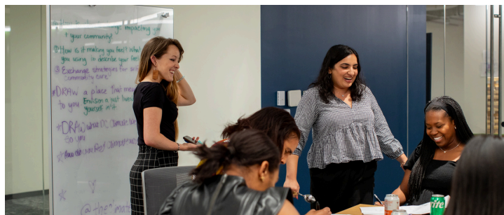
D.C. Climate Week.

FRI partnered with the Youth Climate Collaborative to host two events at DC Climate Week that brought together more than 80 youth leaders from around the world. For the first event we hosted about 40 participants, majority young women, for a collective discussion about climate anxiety that left attendees feeling less isolated and provided them self-care strategies to cope with climate advocacy struggles.