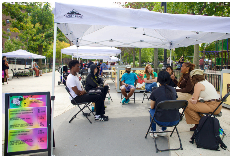
Street Works Earth 2025.

The climate-arts festival Street Works Earth drew nearly 100 artists and activists and thousands of visitors to Jackson Heights, Queens, to explore creative climate solutions, bringing NYC Climate Week out of Manhattan and into one of the most diverse neighborhoods on Earth. Research shows that collaboration between artists and scientists makes data more accessible to diverse audiences and can foster collective action to counter environmental challenges.