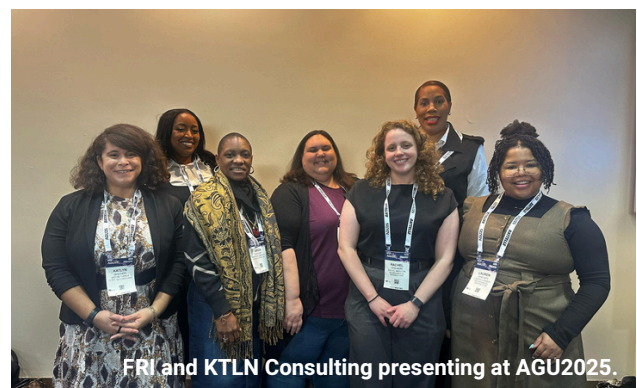
FRI and KTLN Consulting presenting at AGU2025.