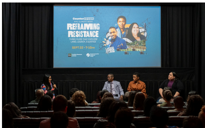
NYC Climate Week Story Salon.

In November, "A People's Climate" podcast from The Nation and Counterstream Media featured the story salon. The podcast, which is in the top 5% of ALL streaming podcasts (yes, of over 3.5 million podcasts out there!), contains vivid testimony to inspire change.